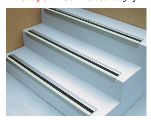
Meet Your Health & Safety Requirements